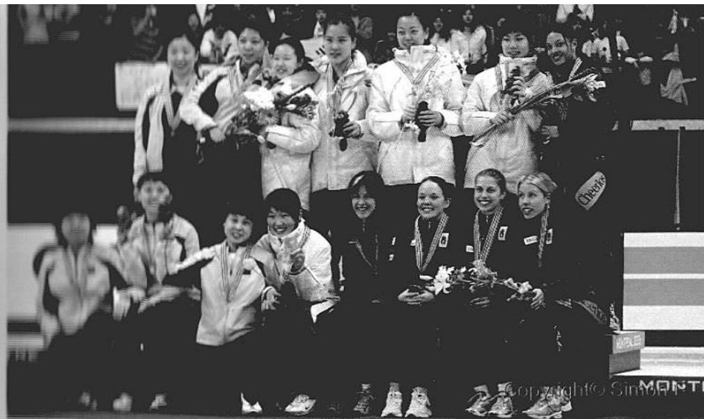
Ladies First - Korea Second - China Third - Canada