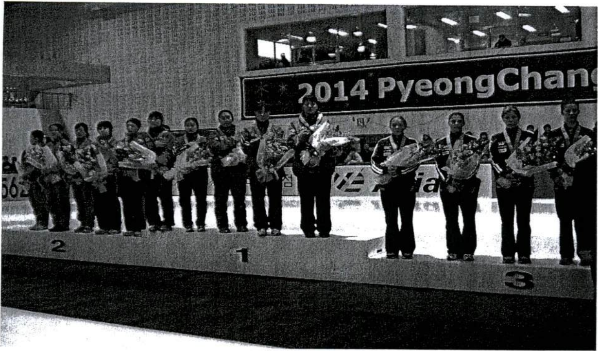
Ladies awarding ceremony