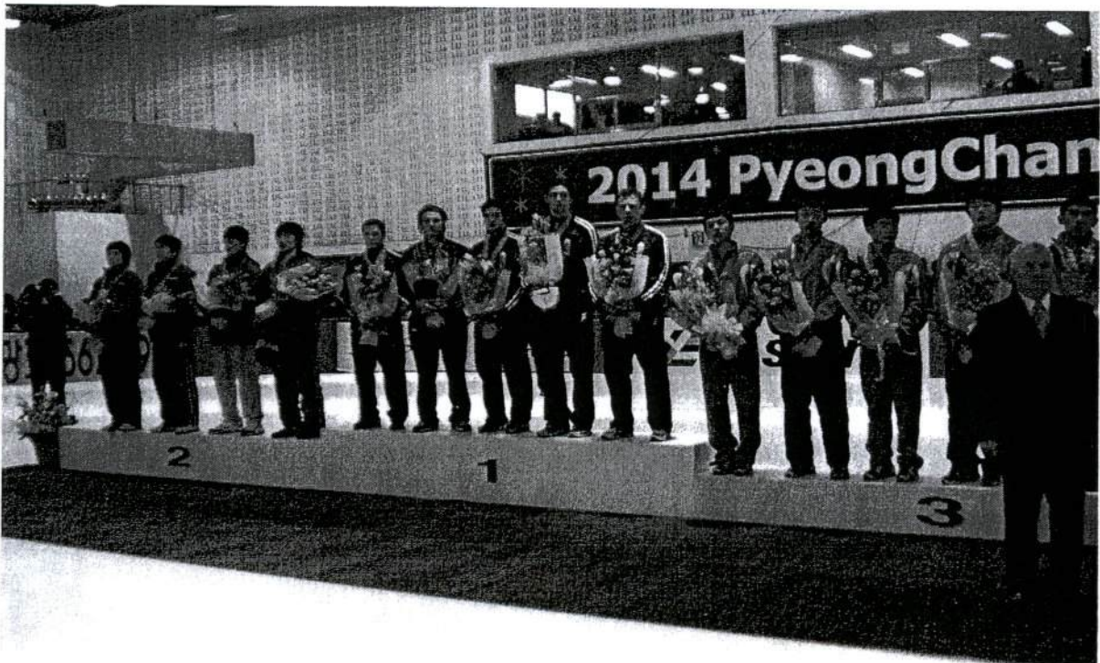
Men awarding ceremony